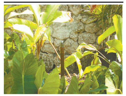
Houses that have installed the SWAT Mosquito System report 90%-100% less mosquitoes, no-see-ums, and other biting insects.

All over the southern U.S., beautiful backyards and swimming pools are going to waste because their owners can't use them. During the day, the summer sun bakes the outdoors making it uncomfortable to remain outside. At night, bugs are the enemy and they feast on any humans they find. Between the lingering heat and the countless insects, outdoor parties are very nearly unbearable.