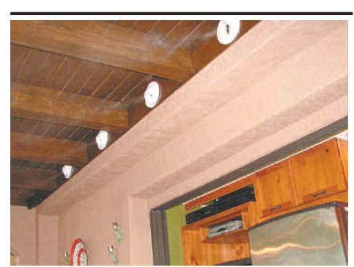
As summer temperatures continue to rise each year, Floridians increasingly find their outdoor areas uninhabitable due to the heat.

The nozzles form a protective perimeter around a property. The systems can be set to spray at whatever intervals and duration the owner needs. Automated timers cut down on the amount of effort and work owners must invest in the system. The misting works best at night, when mosquitoes and similar insects are active, but systems can also be scheduled to spray before an outdoor party or event.